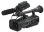
HVR-DR60 Portable Hard Disk Recording Unit