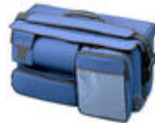
LC-DS300SFT Soft Carr.case For Dsr-300p/500wsp