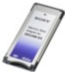
MEAD-MS01 Adaptor for using Memory Stick™ with XDCAM EX products